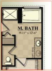
OPTIONAL DELUXE BATH