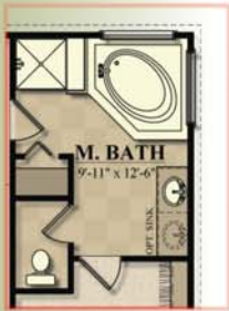
OPTIONAL LUXURY BATH