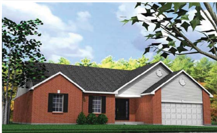
Architectural Style A - Included