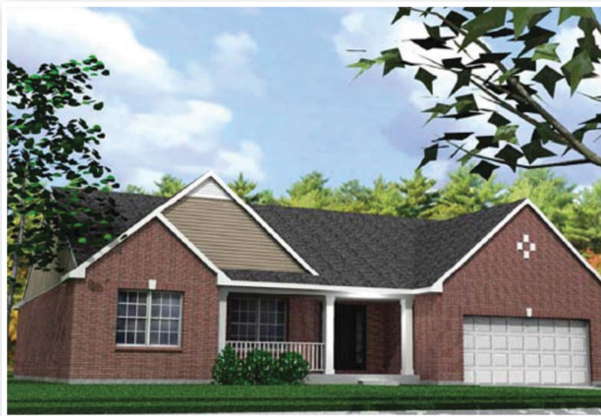
Architectural Style C

Just Step inside, and it's easy to see why families love the Avery. This appealing ranch design—complete with a spacious kitchen with an eating nook and an optional wrap-around bar that opens into the oversized great room, offers plenty of room for families to gather. And the optional room extensions and volume ceilings throughout lend to the overall feel of the open floor plan. A master bedroom with a private bath and large walk-in closet is located just off the kitchen area, and one to two additional family-sized bedrooms nearby another full bath round out the sleeping quarters. A full basement provides room to grow and play, as well as plenty of storage space, and an attached 2-car garage, optional den and a first floor laundry room make this ranch the perfect choice for your family's active lifestyle.