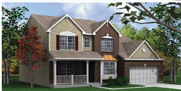
Architectural Style C