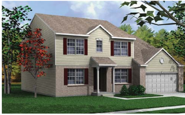
Architectural Style A - Included