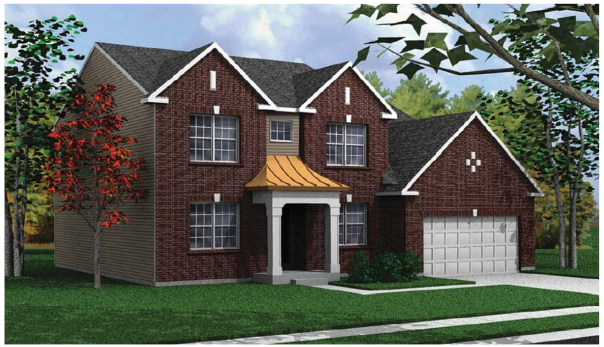
Architectural Style F

The Carrington is a spacious 2-story home with a full basement. The home's charming features include a covered front porch, a formal living and dining room, a grand master suite, and a tremendously large eat-in kitchen. There are also 4 bedrooms plus a generous sized loft, several walk-in closets, 2 ½ baths and a 2-car attached garage to complete the home's functionality.