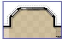
OPTIONAL ANGLED BAY