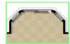
OPTIONAL EXTENDED ANGLED BAY

Standard Floor Plan Rendering Shown All Demensions are Approximate Artist Rendering