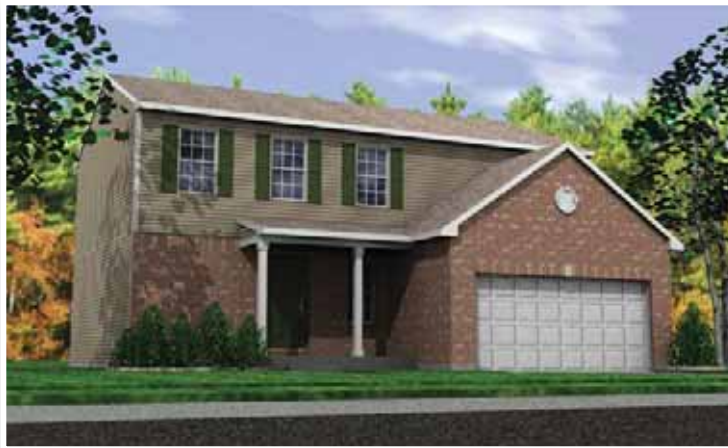
Architectural Style A - Included