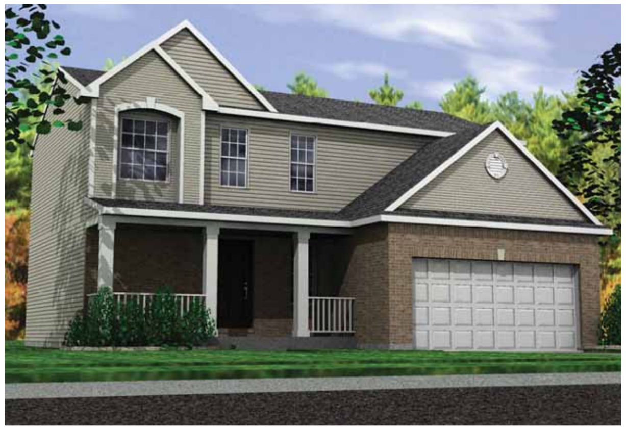
Architectural Style C

This flexible floor plan allows you to add a laundry room to the second floor if desired. The spacious kitchen includes a walk-in pantry and dining area.