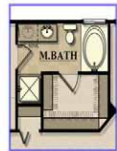
DELUXE MASTER BATH