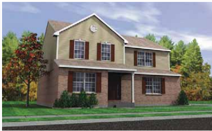
Architectural Style A - Included