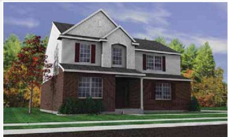
Architectural Style D