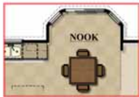
OPTIONAL ANGLED BAY