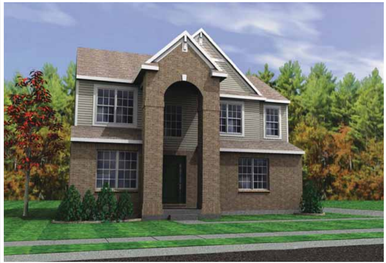
Architectural Style F

The Hillcrest boasts an open floor plan complete with 2 ½ baths, an eat-in kitchen, a combined dining room and flex room, along with a spacious great room. Upstairs, the master bedroom features an incredible walk-in closet and a private bath. Three more bedrooms, a 2-car attached garage, and a basement complete this flexible home.