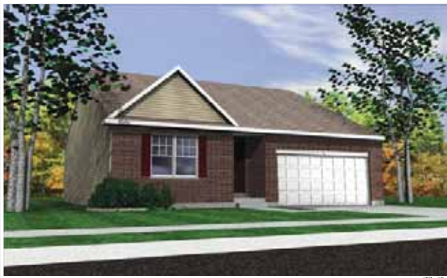
Architectural Style A - Included