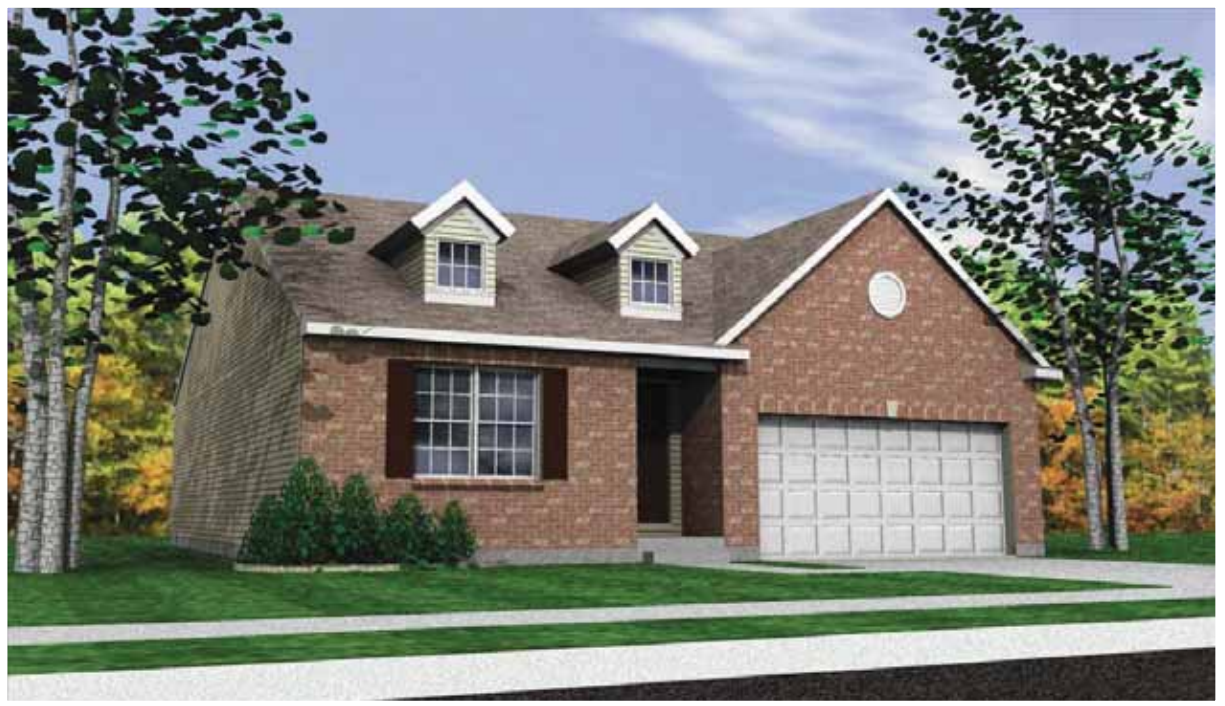
Architectural Style C

The Silverado is an attractive ranch home that features 3 bedrooms or optional den with 2 bedrooms. The foyer leads to the cozy great room that is sure to be the hub of family activity. On either side of the great room, you will find a large, bright kitchen with a walk-in pantry and a quiet, private master bedroom with an expansive walk-in closet and full bath. The delightful home also features another full bath, optional volume ceilings throughout, a 2-car attached garage and a basement.