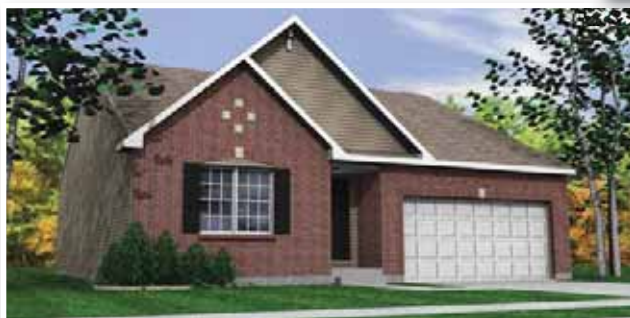
Architectural Style D